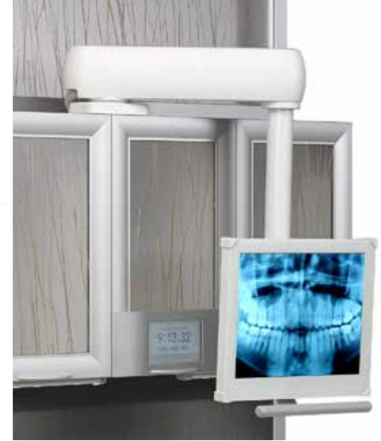
A-dec Inspire® Gliding Monitor Mount