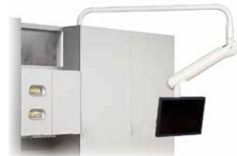
Central Cabinet Mount