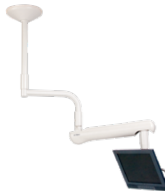
Overhead Ceiling Mount