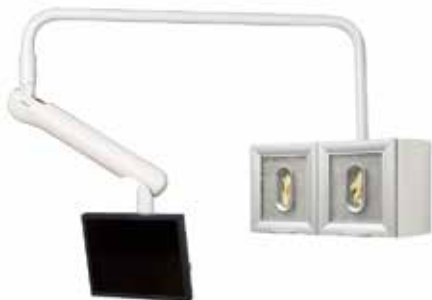
Wall/Side Cabinet Mount