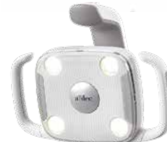
A-dec 300 LED