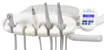
A-dec 300 Traditional