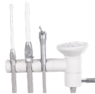
A-dec (aluminum) with touchpad

Three-position holder and telescoping arm conveniently positions vacuum instruments for accessibility.