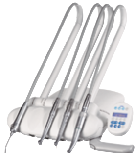
A-dec 300 Continental