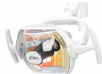
A-dec 200 Halogen

A-dec dental lights provide true light for accurate diagnosis, reduced eyestrain and unparalleled ergonomics.