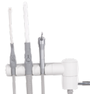
Durr (polymer) without touchpad