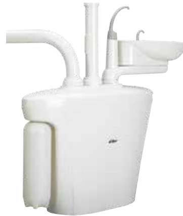
Cuspidor and support center

The porcelain cuspidor swivels for just the right patient position. Easy-to-fill, two-liter water bottle provides a continuous water supply through multiple procedures. The support center offers ample storage room to add ancillaries such as amalgam separators and vacuum systems.