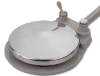
Disc foot control with chip blower

Disc style with chip blower—or new A-dec lever style for precise modulation of electric and pneumatic handpieces.