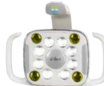
A-dec 500 LED