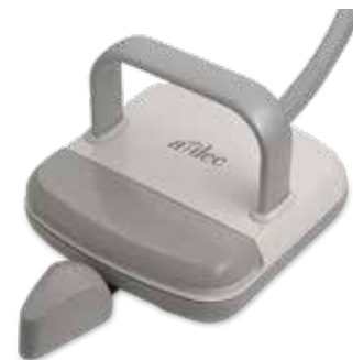
Lever foot control